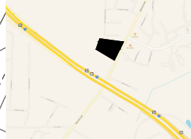
SITE LOCATION (NTS)

PROJECT NAME: THE OVERLOOK AT BELLS FERRY LL789, 16TH DISTRICT CITY OF MARIETTA COBB COUNTY, GEORGIA